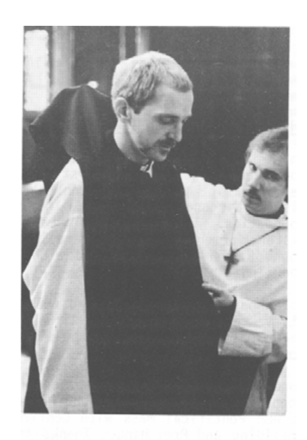
The Scapular, apron of Service