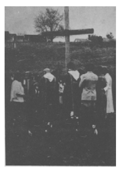
At the Dedication ceremony.