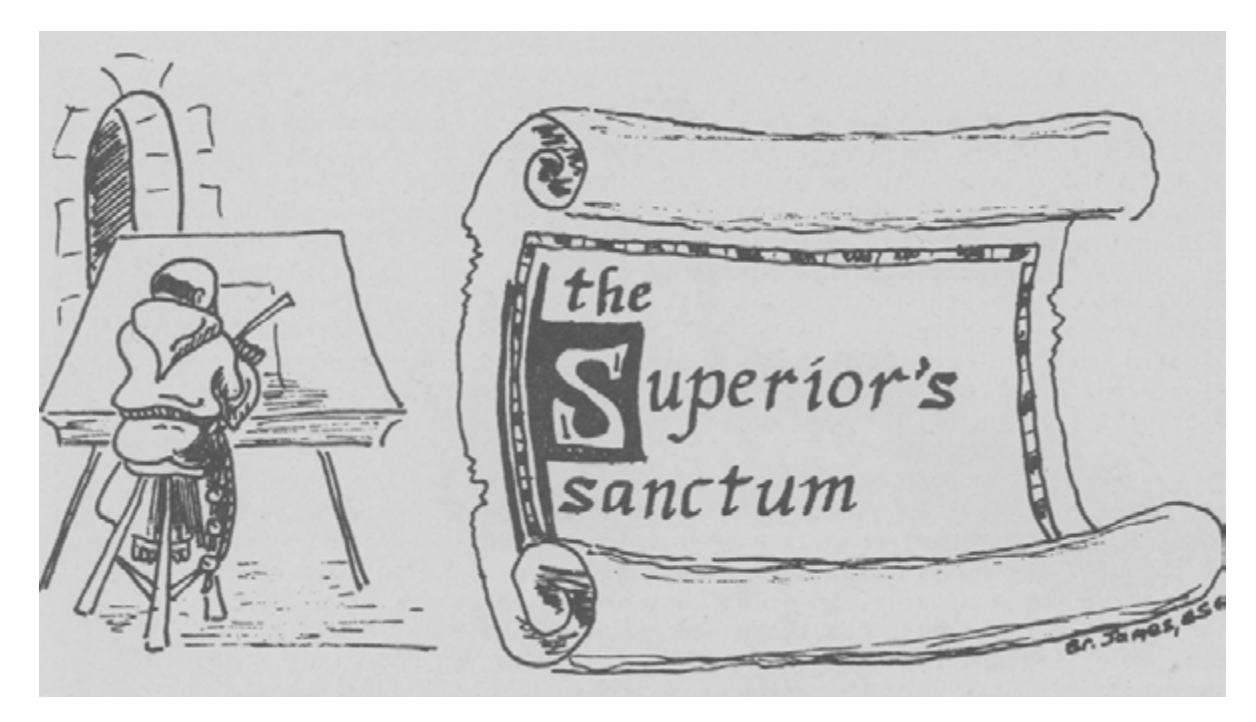
PENTECOST -- GRAND FINALE TO EASTERTIDE

There was a sound like the rush of a mighty wind. Tongues of fire rested on each of them. They were all filled with the Holy Spirit.