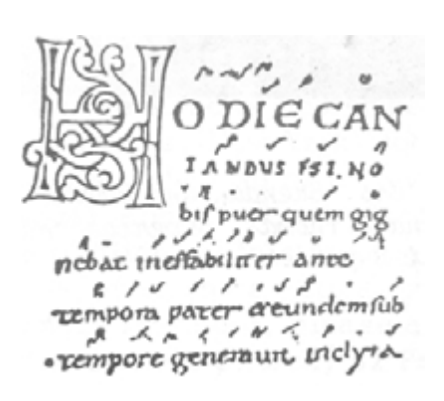
10th century neums

Chant, or the singing of liturgical texts, developed in many of the early churches. It began as a monotone recitation, elaborated by the use of certain patterns, figures and cadences. The exact sources are unknown, though it seems that the psalmody was derived from the Hebrew chant, influenced by the contemporary Greek modal system. In addition, there may have been influence from the native music of the various regions. This process, begun within the first century of the Christian Era, resulted by the sixth century in extensive musical collections in each church: the Ambrosian (in Milan), the Mozarabic (in Spain and Africa), and the Gregorian (in Rome). For most of this period the chant was not written down, but transmitted orally, and performed with the aid of hand signals.