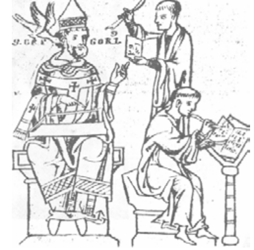
St. Gregory dictating the chant at the inspiration of the paraclete (13th century)

The early 19th century saw a few attempts to revive the chant, but lack of proper scholarship, and the irrepressible desire to "improve" resulted in a hodgepodge of doubtful authenticity. It was for the Benedictines of the congregation of France to bring accurate scholarship to the republication of Gregorian chant, and the Solesmes editions, such as the Liber Usualis, are the basic source for 20th century performance and adaptation.