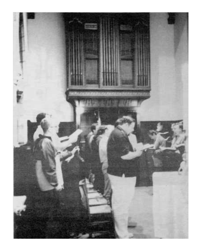
The members of the community fill the small chapel at the College of Preachers .