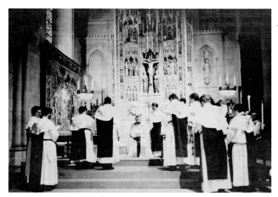
The candidates for life profession are presented to the Superior General by their sponsors.