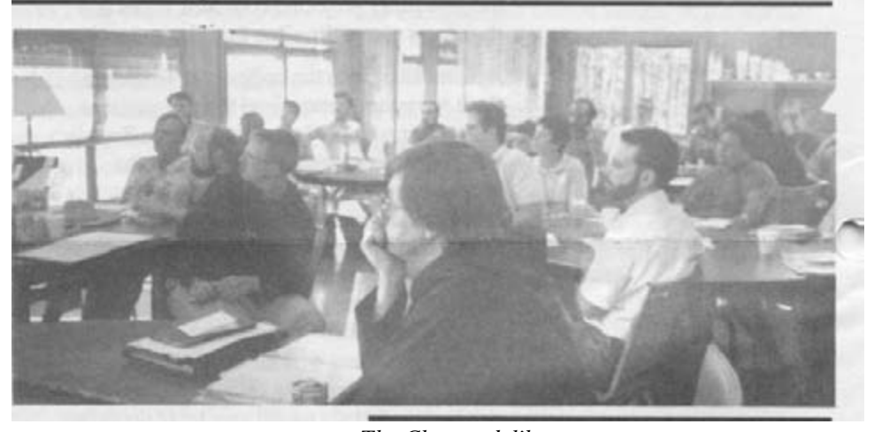
The Chapter deliberates