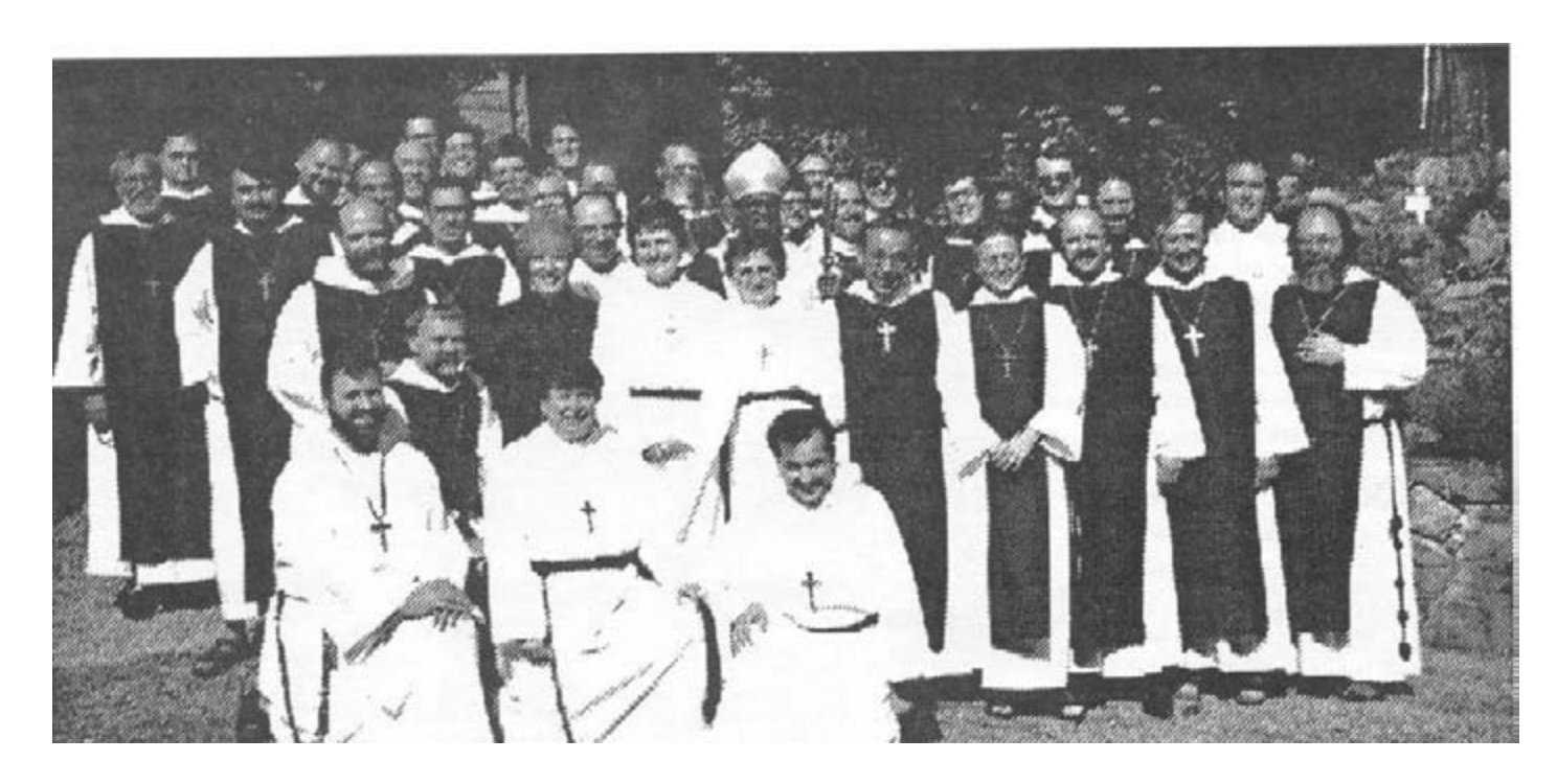
The community and the Visitor, after the main convocation eucharist

couraging us to buy, buy, buy. This will make you happy. This will make you powerful. This will make you popular. Our government fights a war on drugs because of the horrors of drug addiction—yet we are everywhere encouraged to enter into addictive relationships with things—things that can never fulfill us—things that can never bring us any ultimate joy or happiness.