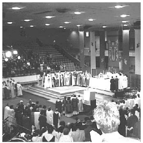
At the ordination service in Brown Arena

one from their mother house in England, were rightly numbered among his "family."