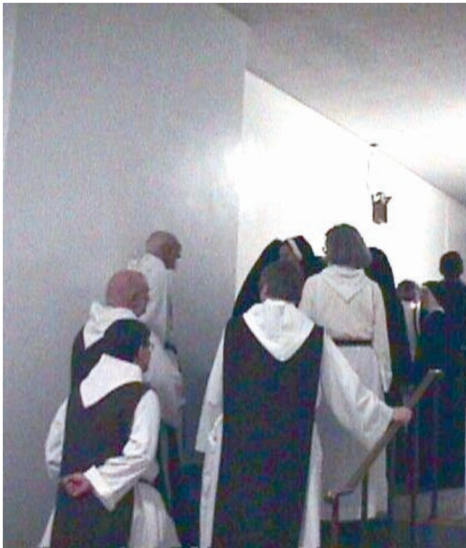
Members of the community climb the stairs to the main level of the Cathedral of Saint John the Divine.