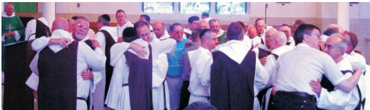
The Community shares the Peace of the Lord.

Reading my response on “God's Will Be Done” from Gregorian Foundations after being admitted as a postulant, I can see that I was just starting to realize that I often then (and still do) tell God what to do instead of asking for grace to do God's will.