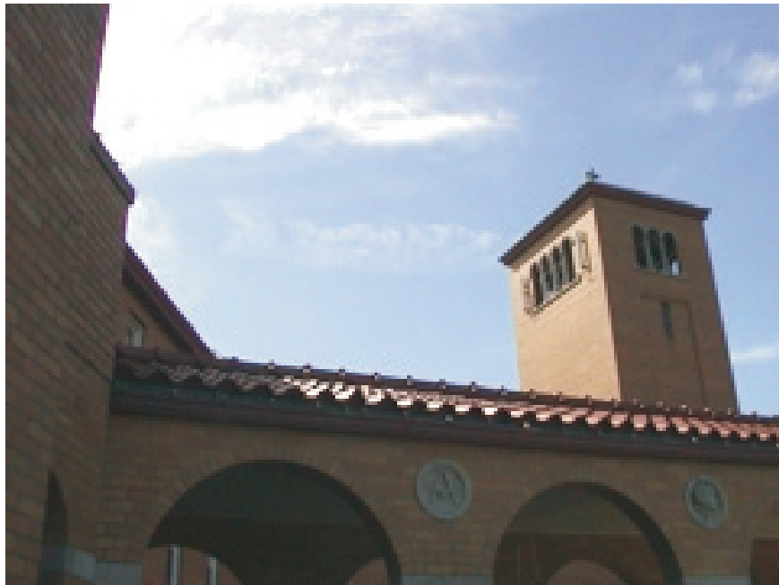
The bell-tower at Mount Alvernia, Wappingers Falls NY