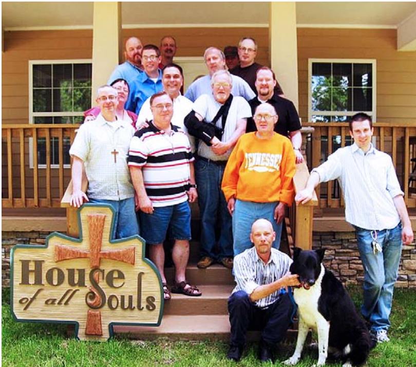
Retreat at the House of All Souls