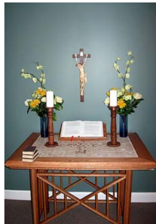
The chapel at House of All Souls