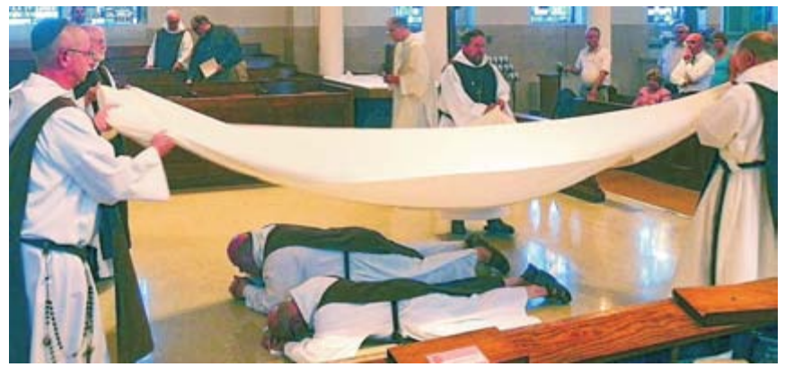
The funeral pall is placed over those about to make life profession of vows by brothers who have gone before on that path of dedication. It symbolizes death to self.

Community in religious life is informed and shaped by the Rule and vows. Being bound to follow a Rule naturally fosters a sense of common purpose among members of the community that informs every aspect of our lives. Parish communities cannot, by there very nature, do this. We come to the table with individual agendas, worship