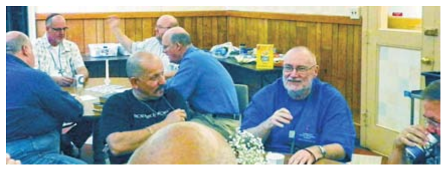
Fellowship and recreation are an important part of community life.

and the expectations on time, talent, and treasure do not often exceed comfort levels — then it is fine.