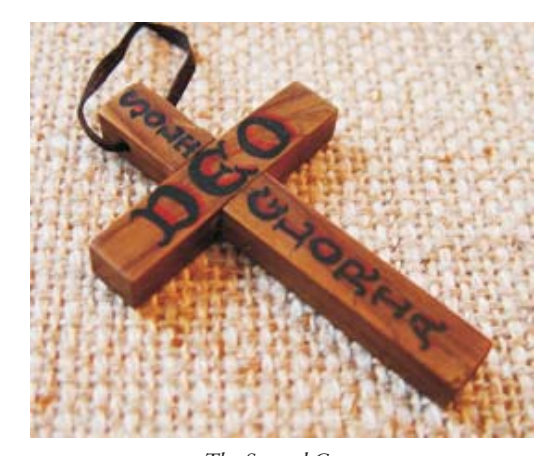
The Second Cross

it extending down to the elbows (supposedly from a German Benedictine pattern). This capuche revision precipitated a need for a larger cross, given that the breadth of the new white capuche rendered the existing cross diminutive. General Chapter of 1981 dealt with this by approving a larger design for the profession cross based upon the 1971 model. Still made of olive wood, but somewhat larger, the obverse inscription remained as "Soli Deo Gloria" but the reverse was rendered as a translation from the Latin: "St Gregory the Great."