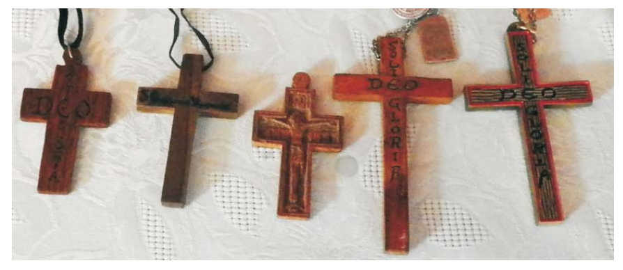
Left to Right the Four Crosses of the Brotherhood, with the crucifix on which the First Cross was modeled in the center

A word needs to be said about the crosses and habits worn by Gregorian postulants and novices, as well. The first example of these crosses came into being with the habit design of 1971. Initially it was assumed that postulants and novices of the Brotherhood would not have a habit respective of their rank and that the cross and habit would be presented upon first profession of vows. Therefore, no separate cross design was envisioned with the habits of 1969 or 1970. This changed with the advent of the brown-and-white habit of 1971, and shortly thereafter the community approved a cross and a habit for both postulants and novices. The postulants and novices wore a cross based upon the wooden blank used for the profession cross, without an obverse inscription; this cross was suspended by a cord. Then, when the profession cross de-