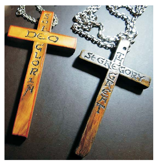
The Third Cross, obverse and reverse

that rendered the side beads optional — while some brothers preferred a variety of Orthodox-style prayer ropes over the traditional decades of the rosary; some preferred not to wear side-beads at all, as the use of the Rosary was never a required form of devotion. Another change was discontinuance of the capuche and cowl in favor of a cleaner, more streamlined look. This resulted in the Brotherhood's habit now being comprised of a white, hooded tunic; a brown scapular (for brothers in profession); and a brown cincture bearing the three knots representing the vows; and of course, the profession cross. Other options included the zucchetto and the creation of the "Witness Shirt" — a habit better suited to travel, originally