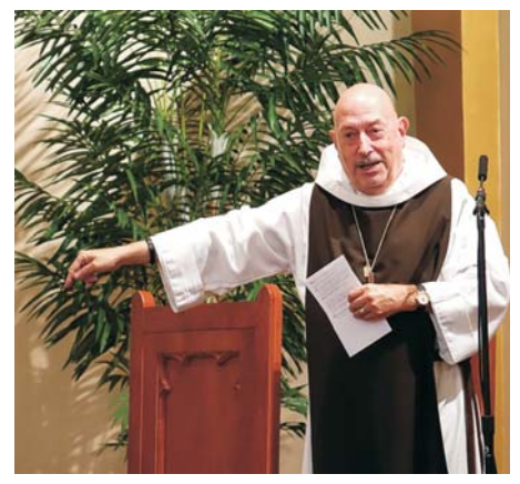
The Minister General points to the spot on which he made his profession of vows in 1969.

The opening article in the last Servant included some reminiscences of the early days of the Brotherhood, and an impending visit to the site of that foundation. What I had hoped for, and dreamed for many years, came true, and I was able to share with the Brotherhood as it is today, the place of that 1969 foundation: the Visitation Monastery in Riverdale, Bronx, NY. We traveled together in a chartered bus, box lunches in hand, and arrived without mishap on a beautiful summer morning. The main building is as I remember it—from the outside. I suppose I hoped the interior of the chapel would remain unchanged; alas several re-workings of the monastery,