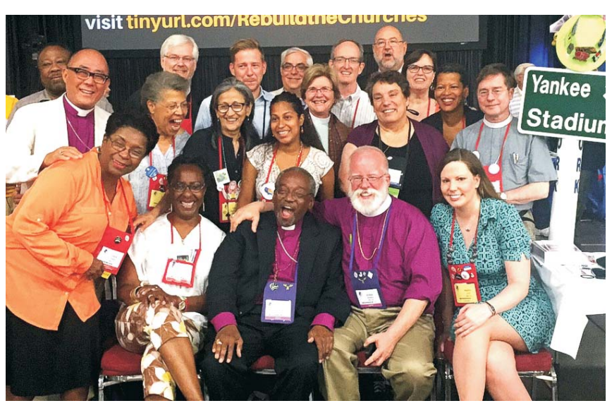
Presiding Bishop-elect Michael Curry visits for a photo opportuity with the New York deputation to GC78.