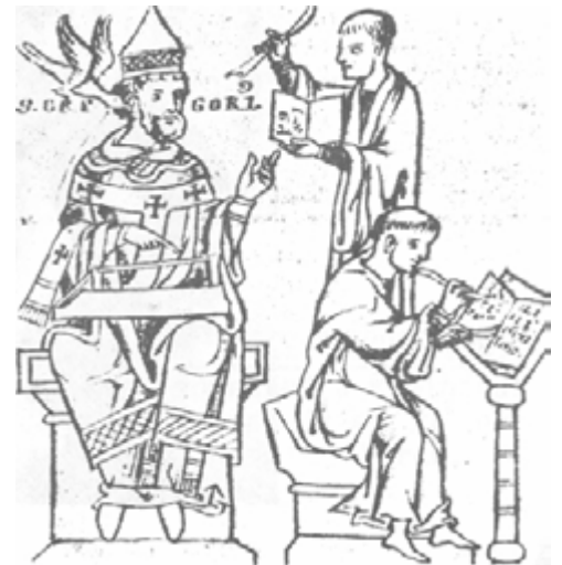
St. Gregory dictating the chant at the inspiration of the paraclete (13th century)

The early 19th century saw a few attempts to revive the chant, but lack of proper scholarship, and the irrepressible desire to "improve" resulted in a hodgepodge of doubtful authenticity. It was for the Benedictines of the congregation of France to bring accurate scholarship to the republication of Gregorian chant, and the Solesmes editions, such as the Liber Usualis , are the basic source for 20th century performance and adaptation.