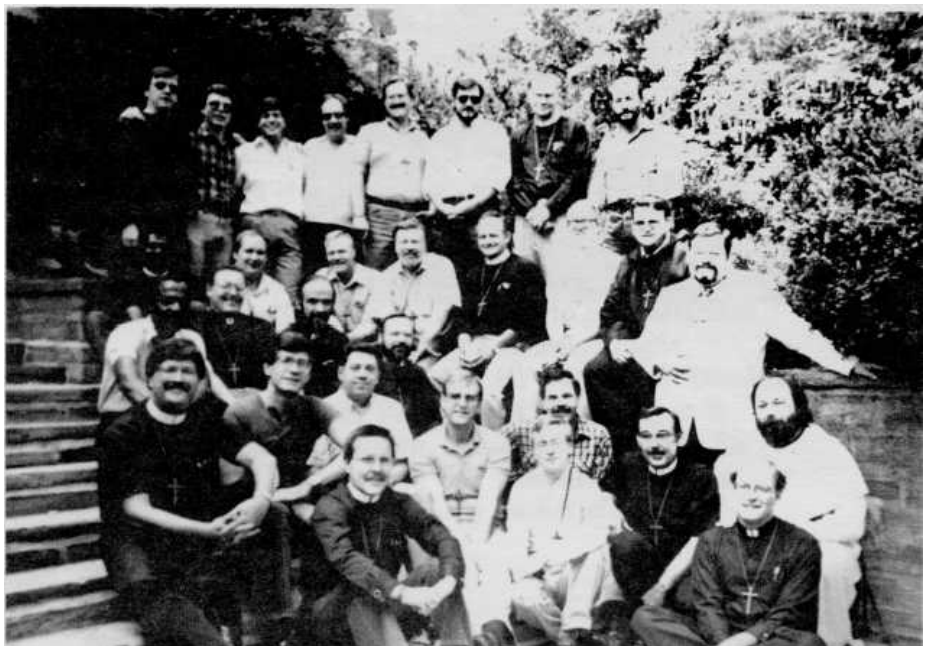
The community gathers on the steps of the College of Preachers.