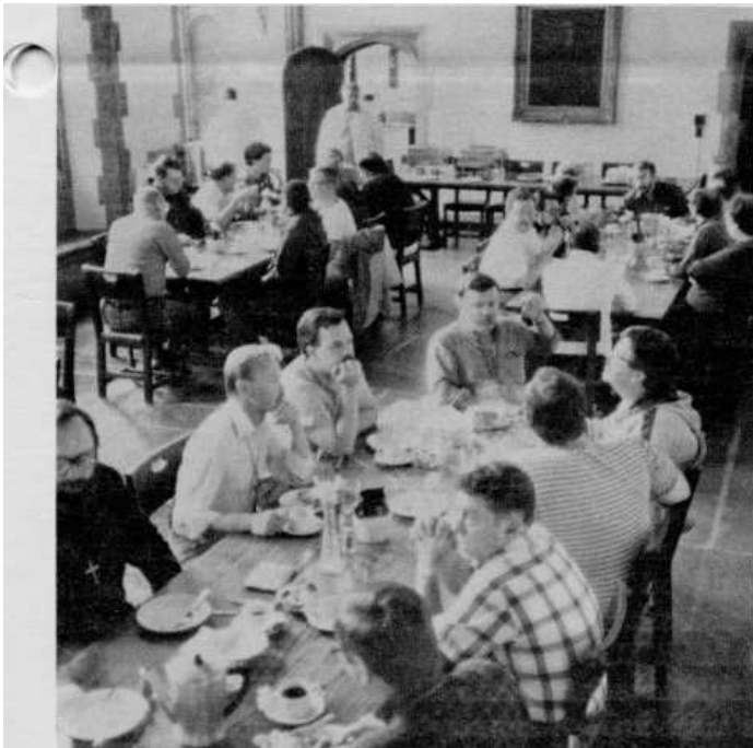
The refectory, during the retreat .