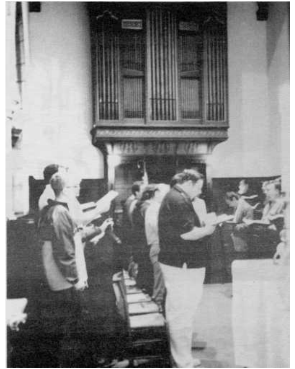
The members of the community fill the small chapel at the College of Preachers .