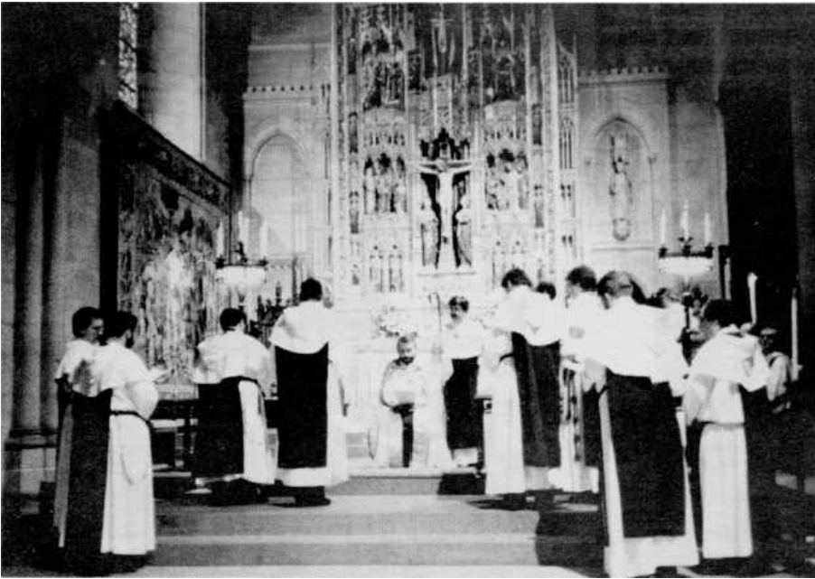
The candidates for life profession are presented to the Superior General by their sponsors.