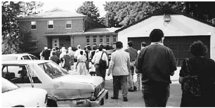
The congregation processed from Holy Rosary parish church to Fessenden House, the former convent on the parish grounds.

Completion Ceremony of two Fessenden House residents from their ATS programs. The ceremony was held outdoors on the grounds of The Huston-Cortez Residence, and marks a special milestone in the lives of these men who have successfully completed 18 months of a drug and/or alcohol rehabilitation program.