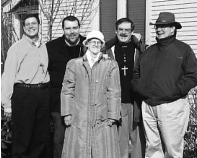
Members of Province I gather for a blustery quiet day.