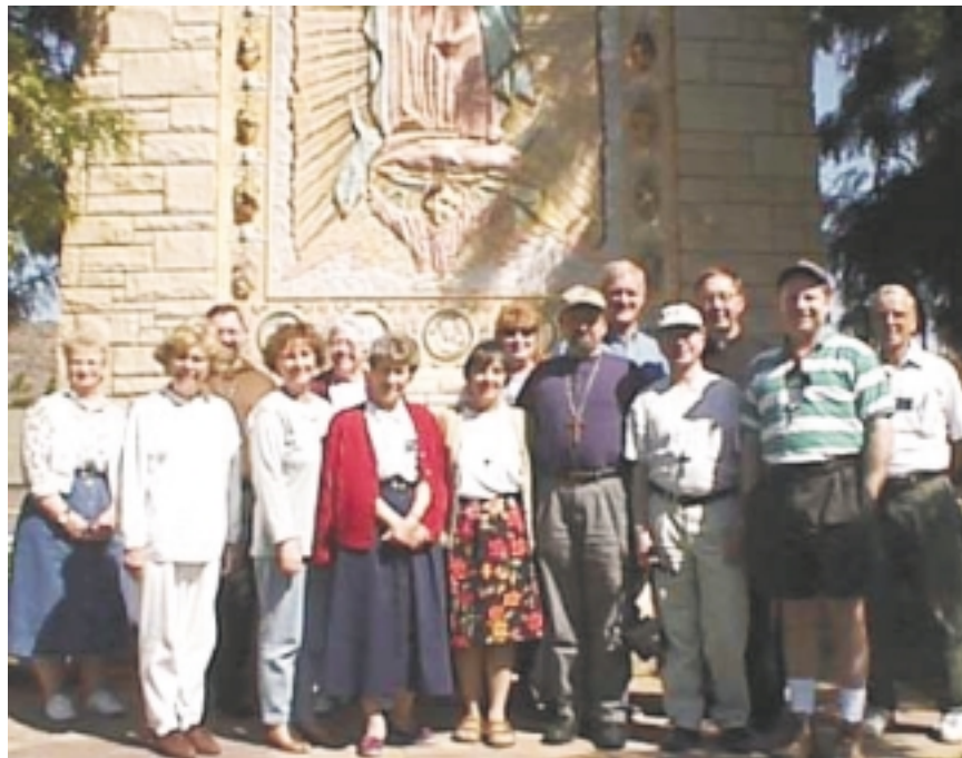
Representatives of five Episcopal communities pose at the Guadalupe shrine at the Scottsdale Franciscan Renewal Center.