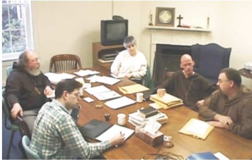
The Education Committee discusses the third section of the Formation Program.