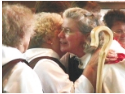
... and she embraces her sisters.