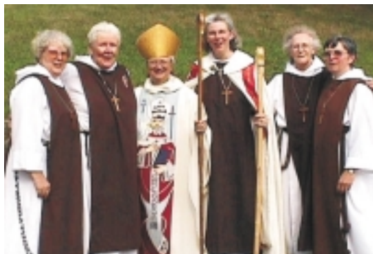
The newly life- and first-professed sisters with their Visitor

We do, in fact, remain, in this separation and change, the Body of Christ — "from him the whole body, joined and held together by every supporting ligament, grows and builds itself up in love, as each part does its work." We came together many years ago; the ligaments stretched and, in fact, there were even some broken bones. The whole body survived, bound together in love, building up the community and the church. This will always be a treasure and a gift.