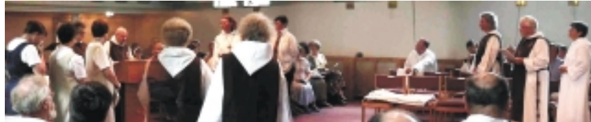
The Minister General gives his charge to the assembled sisters.

At this point in time, I am reminded of the words “God the Sculptor of the mountains” from the wonderful hymn in Wonder, Love, and Praise . God is the sculptor who fashions and forms us, the artisan of the world and the creator of this community of faith, and the one to be formally launched tomorrow. I can only think of an opening from a recent homily for this gathering: “My Lord, what a time, what a time, what a time!”