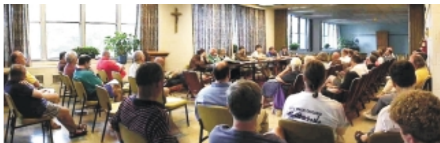
The community gathers for a panel discussion on the nature of Gregorian "community in dispersion."