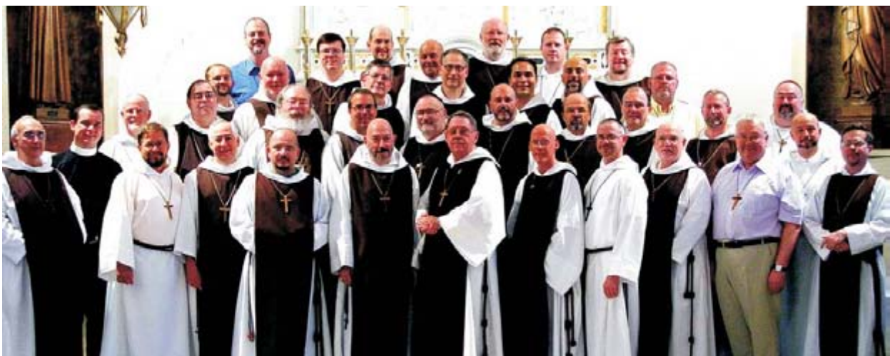
The Brotherhood Convocation 2005

John of Damascus, an eighth century priest, said in a sermon: “Anne was to be the mother of the Virgin Mother of God, and hence nature did not dare to anticipate the flowering of grace. Thus nature remained sterile, until grace produced its fruit. For she who was to be born had to be a first-born daughter, since she would be the mother of the first-born of all creation, ‘in whom all things are held together.’” John goes on to say, “Joachim and Anne, how blessed a couple! All creation is indebted to you. For at your hands the creator was offered a gift excelling all other gifts: a chaste mother, who alone was worthy of the creator... The conduct of your life pleased God and was worthy of your daughter. For by the chaste and holy life you led together, you have