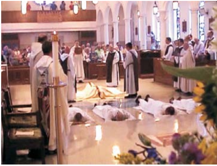
Candidates for profession lie prostrate during the litany.