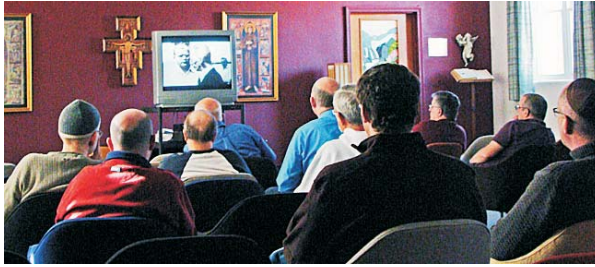
Viewing the documentary on Bonhoeffer's life

ground to his writing Life Together . Through three further sessions the brothers reflected on and discussed the similarities disclosed by Bonhoeffer and compared them with our individual experiences in our various ministries. What Bonhoeffer recorded in his book was in many ways familiar to our own daily experiences in prayer, focus and mission, though his grounding in Luther's Evangelical theology and his mode of expression often varied from ours as Anglicans. Also noted were some differences in style and substance that even sixty years of Western Christendom have introduced into our thinking. Our traditions, though often similar, were not always the same.