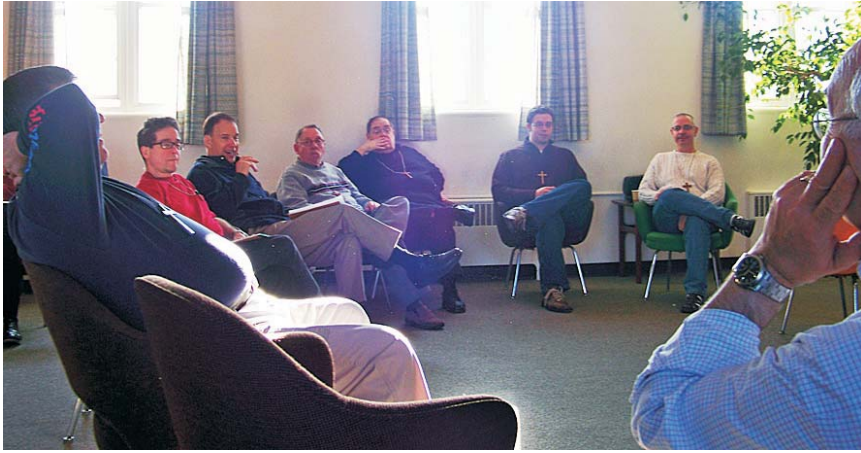
Group discussion forms an important part of Convocation.

through the Rule of our order — so that we each may be restored to our common purposes.