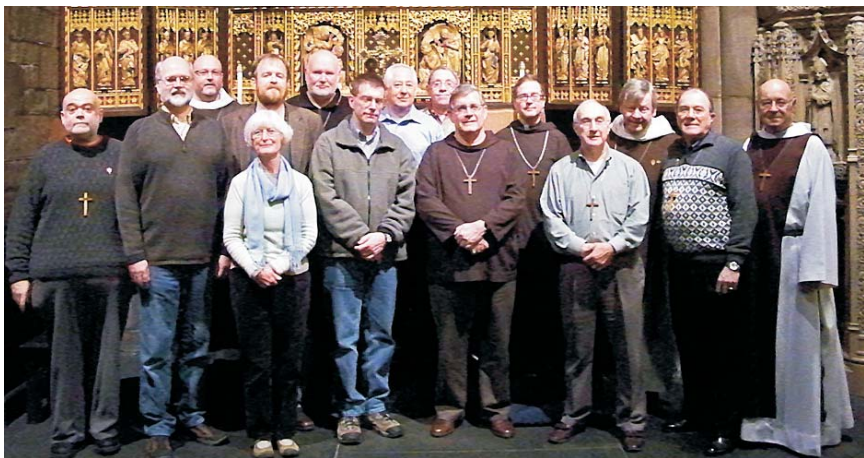
BSG and TSSF at Saint Mark's, Philadelphia

"Getting the Word (of God) Out: An Advent Day of Reflection" was the title of the Province 2 Advent retreat, co-sponsored by the Brotherhood and Saint Mark's Episcopal Church, Philadelphia, and brothers from all around Province 2 journeyed to