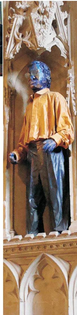
Bonhoeffer's image at Saint Alban's Abbey in England

Exercises developed by our Education Committee brought into focus how the relationships between us were shared by the budding pastors in Bonhoeffer's seminary, and also heightened our own awareness of the unique aspects of the Brotherhood's Rule. As the retreat program concluded, each brother experienced the opportunity to put into words his own formation and to discuss the benefits that formation had provided him for life in community and ministry. We left Mount Alvernia both refreshed and thankful for the community prayer time and for our time spent in learning more about who we are and why we are called to do what we do. And we are most grateful for the sacrifices Dietrich Bonhoeffer and his brothers made for the life of Christ's church, and how they benefit us in our own time.