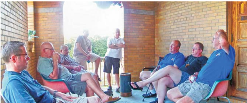
Fellowship and conversation "on the porch"