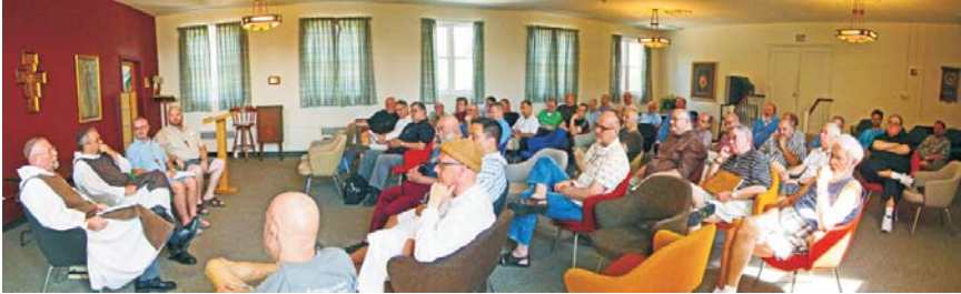
The panel discussion on the Vowed Life

The Brotherhood gathered from around the world for Annual Convocation and Chapter in late July, at Mount Alvernia Retreat and Conference Center in Wappingers Falls, New York. The week served as a refresher course in the call along a path governed by the Brotherhood's Rule.