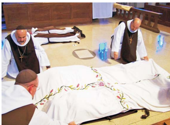
The pall symbolizes death to the old way of life.