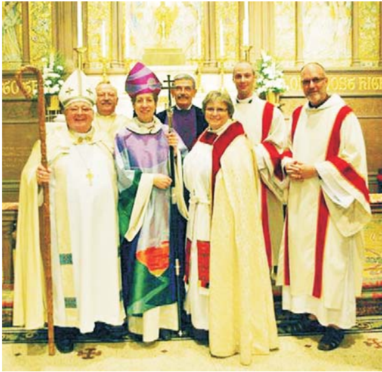
The Presiding Bishop at Saint Paul's Cathedral, Buffalo