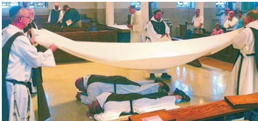
The funeral pall is placed over those about to make life profession of vows by brothers who have gone before on that path of dedication. It symbolizes death to self.

Community in religious life is informed and shaped by the Rule and vows. Being bound to follow a Rule naturally fosters a sense of common purpose among members of the community that informs every aspect of our lives. Parish communities cannot, by their very nature, do this. We come to the table with individual agendas, worship