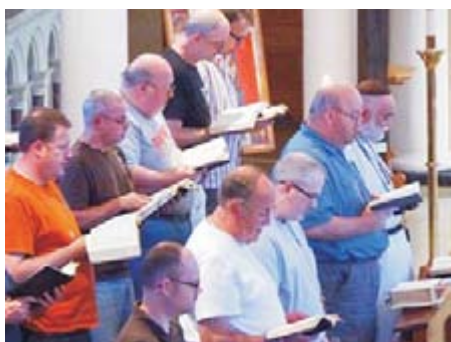
Recitation of the daily office

educator as he presented “Brothers Acting as Local Encouragers for the Ministry and Mission of the Whole People of God.”