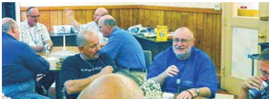
Fellowship and recreation are an important part of community life.

and the expectations on time, talent, and treasure do not often exceed comfort levels — then it is fine.