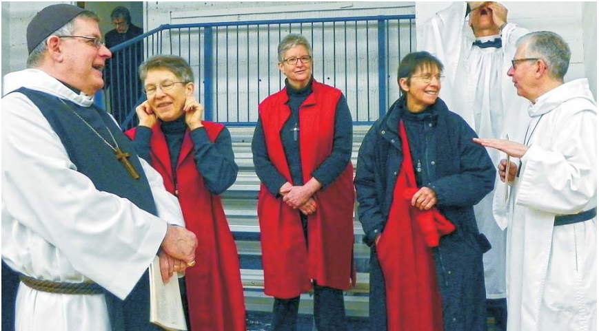
A jolly group from BSG, CHS and OHC, prior to the consecration