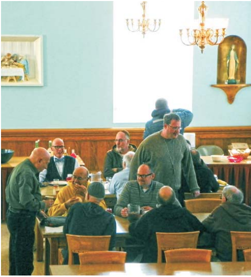
In the refectory...