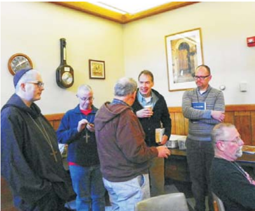
...and at recreation

As with all Brotherhood convocations and retreats, the sound of laughter is gently mixed in our memories with the prayerful solemnity of the Holy Eucharist and our