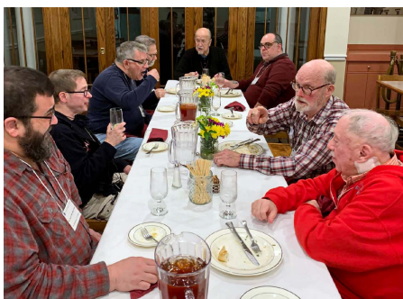
Province 3 at the meal table...