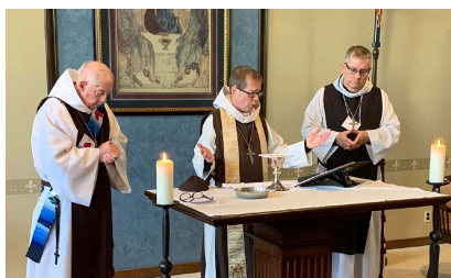
...and at the worship table