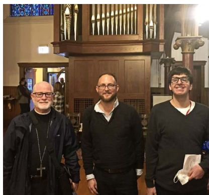
...and with colleagues Segal and Carpenter