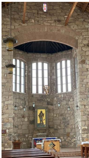
Saint Joseph's Apache Mission Church, Mescalero NM