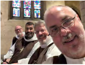
On Sunday morning, several of the brothers attended worship at Saint Paul's K Street in DC.

happening in community and church life through the coming years. He led two groups of brothers through reflection questions intended both to draw on past experience and evoke hopes and concerns for the future.